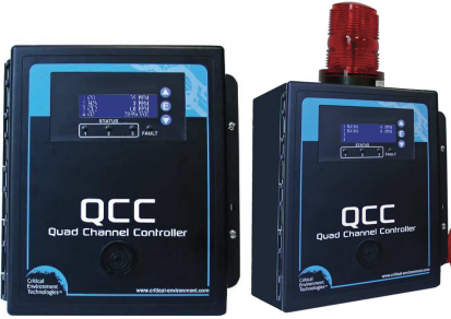
QCC shown with Options L and SW

The QCC Quad Channel Controller offers four channel configurations for monitoring toxic, combustible and/or refrigerant gases with versatile control functionality for non-hazardous, non-explosion rated, commercial and light industrial applications. It is designed to accept inputs from up to four remote digital and/or analog transmitters using digital or 4-20 mA analog input. The QCC is available in two models, the QCC-M with Modbus® RTU RS-485 output or the QCC-B with BACnet® MS/TP RS-485 output for communicating with a Building Automation System (BAS).