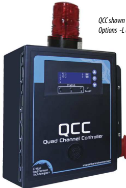
QCC shown with Options -L and -SW.