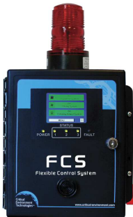
FCS shown with Options DL, L and SW